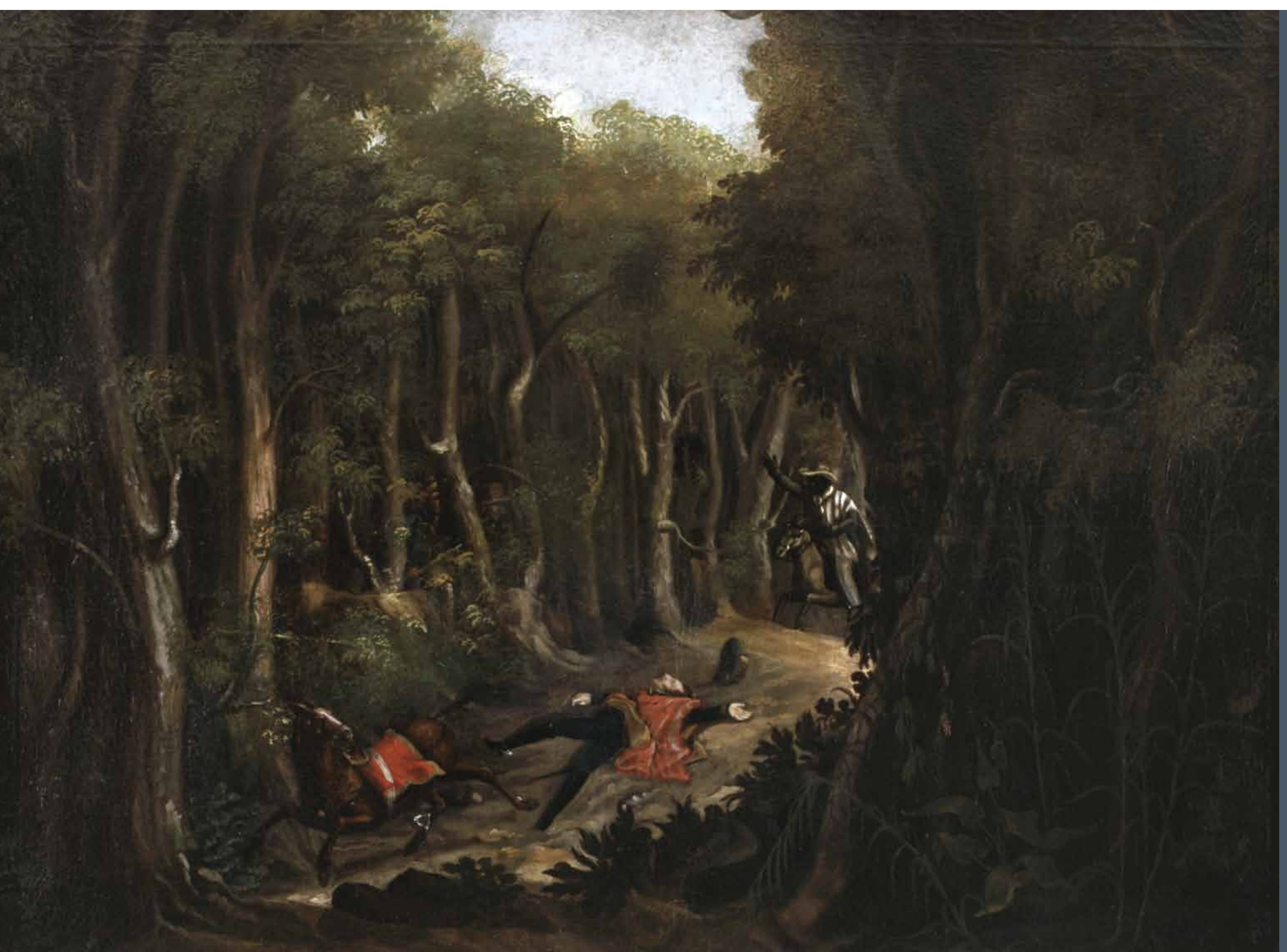
In the case of heroes that were murdered on an open field, the scene is shown in a dramatic and condemning way.

Asesinato del general Sucre en Berruecos